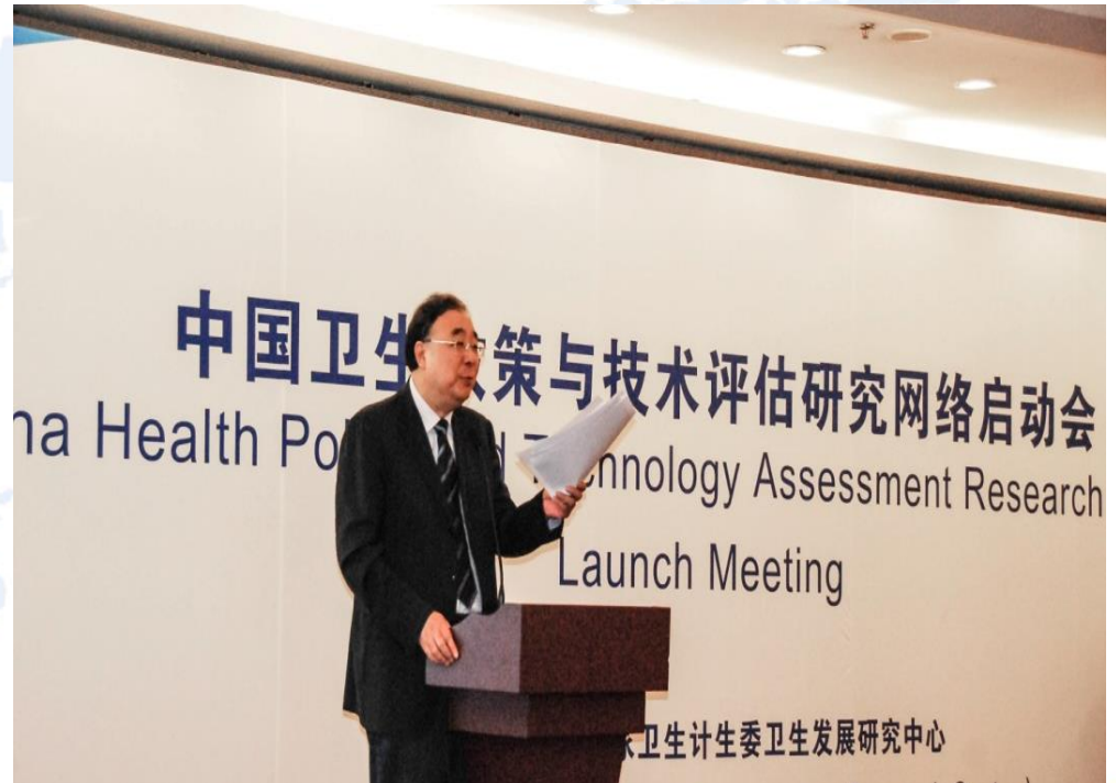
Health Minister Xiaowei Ma and Deputy Health Minister Yixin Zeng