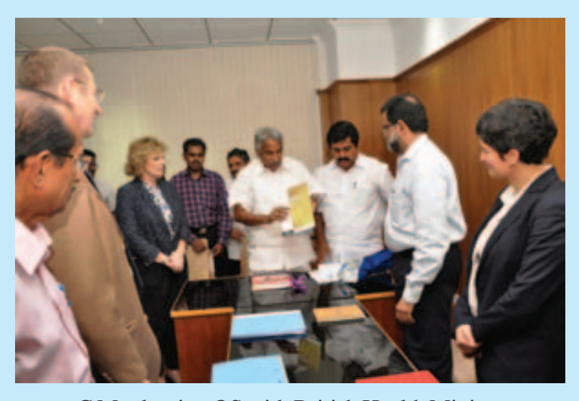
C M releasing QS with British Health Minister